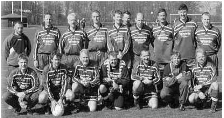
Ostfriesland SV Petkum Alte Herren on Sat. Oct. 2. at 3:30 pm a special friendly soccer game between a team of Oldtimers from Ostfriesland Northern Germany "S.V.Petkum" that play in their region's "Altliga" and an Ottawa Oldtimers Select team at Maple Leaf Almrausch Club, 3928 Farmers Way.

Adequate Parking Available Fax. (613) 233-5839