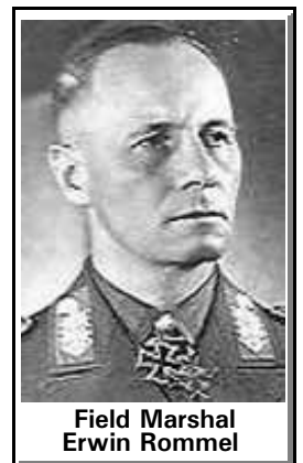
Field Marshal Erwin Rommel