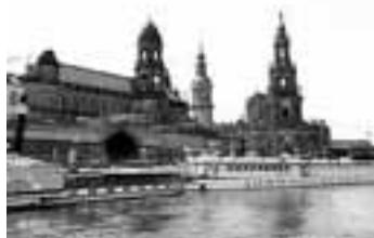
Dresden on the Elbe River is one of Germany's architectural gems

Germany has more than 7,000 kilometers (4,350 miles) of interconnected rivers, canals and lakes