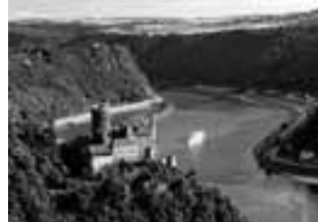
Rhein mit Loreley in St. Goarshausen

whose waters are plied by barges and sailboats, cruise ships and kayaks.