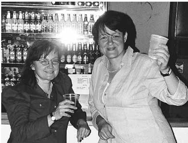
A Cool Break!