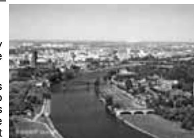
The Elbe River runs from Hamburg, through Magdeburg (pictured here), to the Czech border.

One of the great pleasures of the cruise experience is sitting back and taking it all in -- sipping a Riesling or Pilsner while watching the scenery go by. But a river cruise doesn't need to be an entirely passive experience. There are plenty of chances to stop and visit the castles, palaces and vineyards dotting the banks of the main tourist rivers: the Rhine, Weser, Danube, and Mosel.