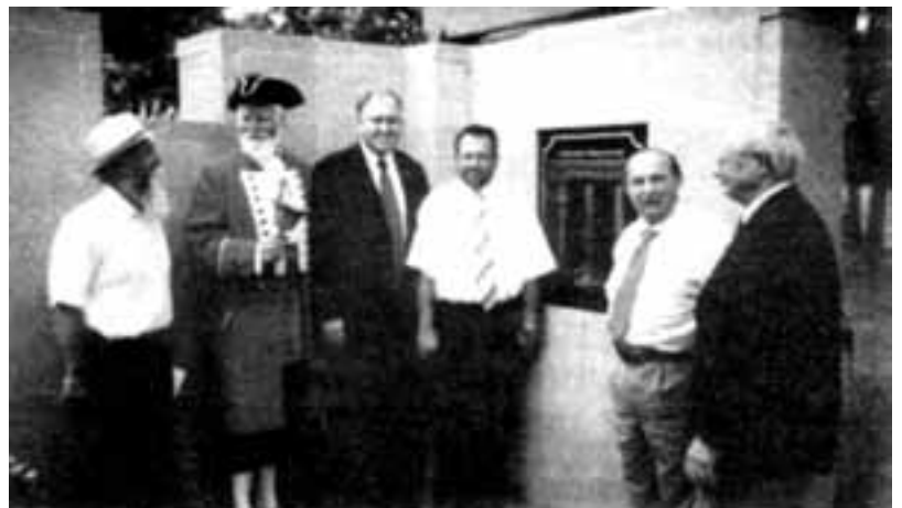
Vor der Gedenktafel der deutschen Siedler

SETTLERS NAMES ON COMMEMORATIVE PLAQUE: Baker, Barkey, Break, Brillinger, Brownsberger, Burkholder, Byer, Castator, Cober, Cummer, Detweiler, Doner, Eby, Eyer, Feightner, Fierheller, Fisher, Franks, Gohn, Grove, Heise, Herr, Holly, Hoover, Horner, Kaiser, Keffer, Kindy, Klinck, Koch, Kreider, Lehman, Lichti, Line, Miller, Mishler, Musselman, Nigh, Nighswander, Oberholzer, Oster, Pike, Pipher, Putterbaugh, Ramer, Reaman, Reesor, Smith, Shank, Sherk, Shisler Shunk, Snider, Spiger, Steckley, Sticklely, Stong, Stouffer, Stover, Strickler, Stump, Troyer, Wideman, Winger, Wise, Wismer, Witmer, Wurtz, Yake.