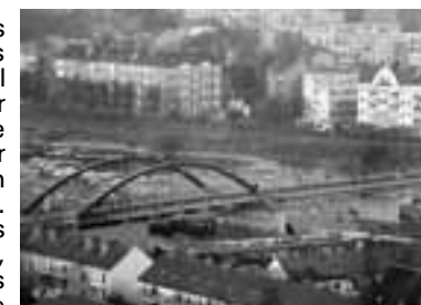
The Oder River divides Germany and Poland. At the town of Frankfurt an der Oder, visitors can walk across the bridge to the Polish town of Slubice.