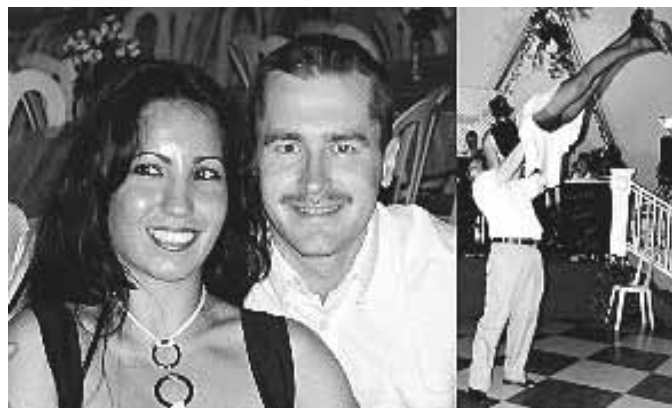
Impromptu Swing Dancers