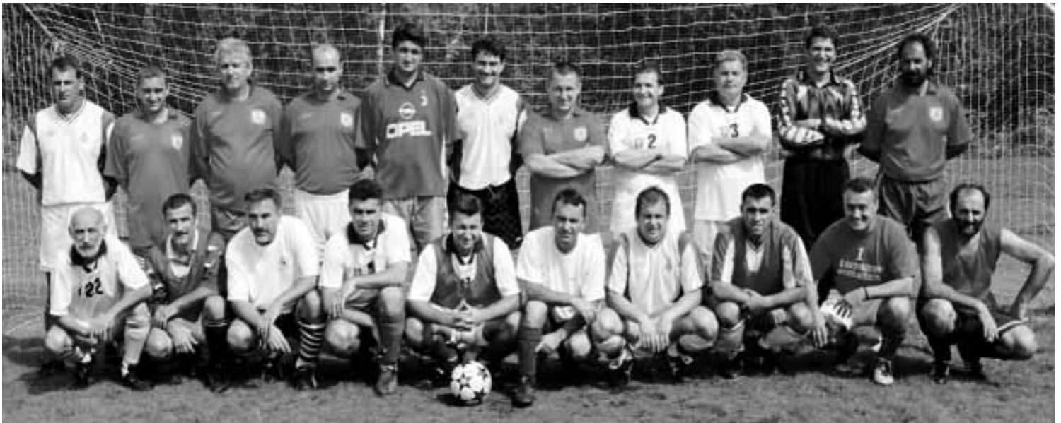
St. Stefan Oktoberfest Cup Tournament Champions (in white)