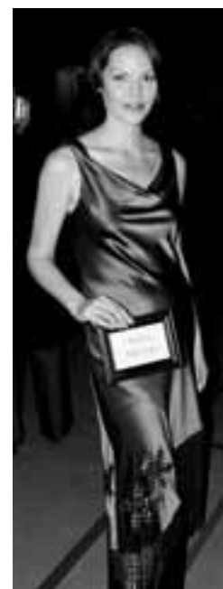
Holt Renfrew model wearing Betty Barclay's designer clothes