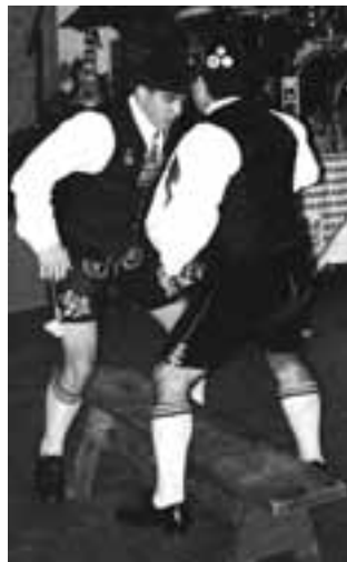
Bench Dance! Performed by the G.T.E.V. Maple Leaf Almrausch folkdance group