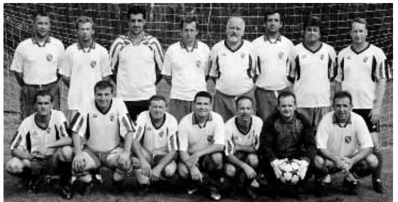
FK Friends of Bosnia Soccer Club - Semi Finalists

3730 Richmond Road Suite 101 Nepean Ontario, K2H 6B9