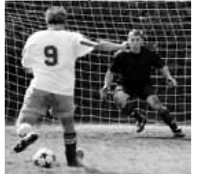
Free Kick in Overtime! This year, many free kicks were needed during this tournament, to decide which teams would advance to the final game.