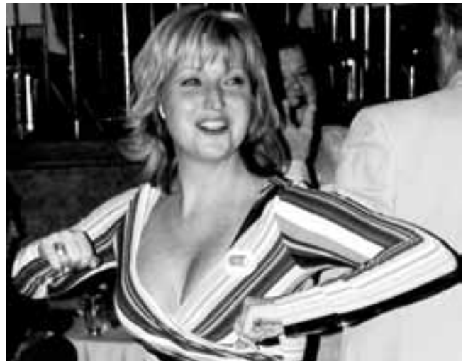
The Chicken Dancer!