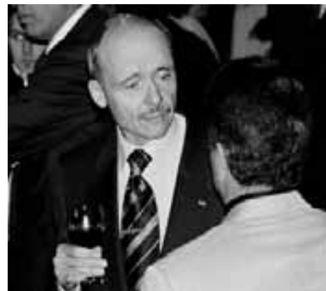
Honorable Don Boudria, P.C., M.P. (Glengarry-Prescott-Russell)