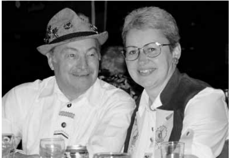
Smile You're on The HBH News Candid Camera!

Sold Out Oktoberfests at the Maple Leaf Almrausch Club, Saturday, Oct 2 nd and 23 rd