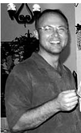
Hugh Kruzel Konzelmann Estate Winery