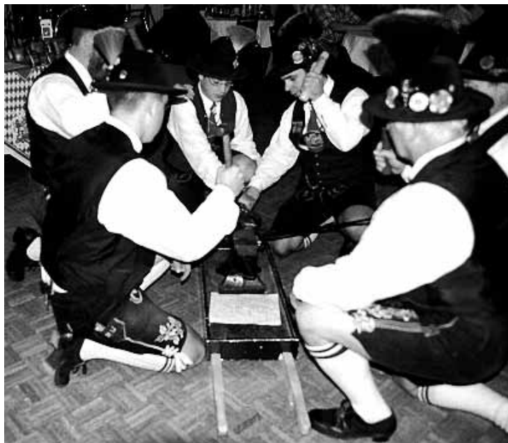
The Miner's Dance