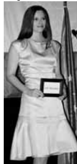
Holt Renfrew model wearing Jill Sander's designer clothes