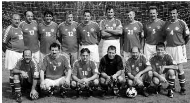
FK Croatian Jadran Soccer Club Oktoberfest Cup Tournament Finalists