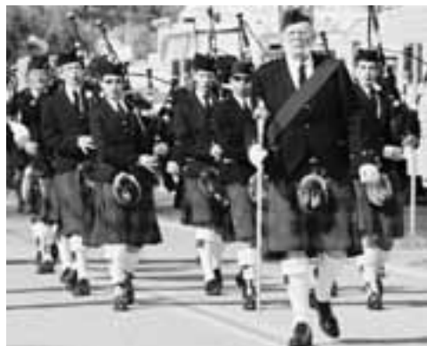
Arnprior McNab Pipe & Drums