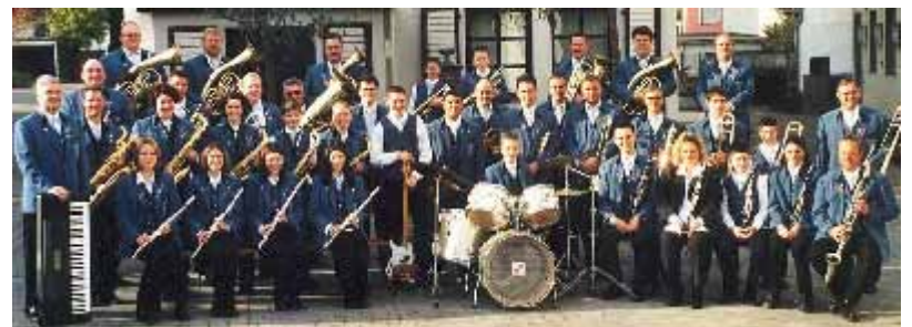
Urmitz Blaskapelle www.mv-urmitz.de