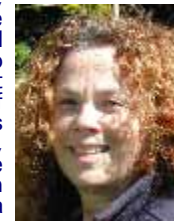
Article by Theresa Durning published in the Picton Gazette and reprinted with permission Continued from page 1

Our Community Museums have the means to provide documentation of the →