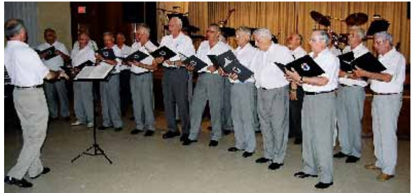
Concordia Male Choir of Ottawa