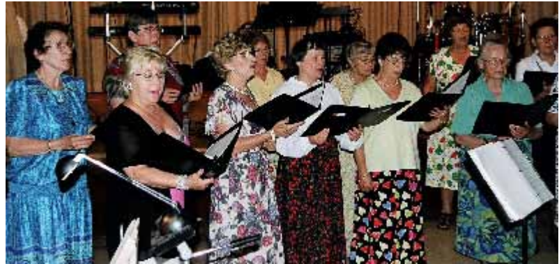
Concordia Female Choir of Ottawa