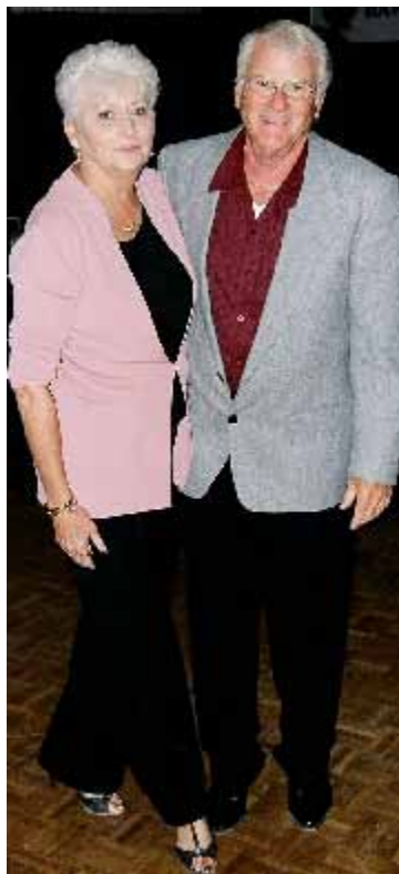
A Smooth Tango! The Zitters