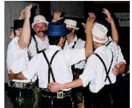
A Musical Hat Dance!