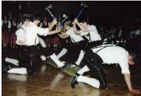
The Alpine Dancers of the Alpine Club, Kitchener - Waterloo

Außenministerium der damaligen Regierung in Österreich gegründet worden war. "Die im Ausland lebenden Österreicher sind die wahren Repräsentanten ihrer Heimat, die die Wichtigkeit erkennen, ihre Kultur aufrecht zu erhalten". Er sprach auch über die Interpretation der Bedeutung der Heimat. Unter anderem sagte er: "Heimat" ist keine Region, kein regionales Gebilde mit Staatsgrenzen, es ist was man in seiner Jugend empfunden hat, es kann ein Klang, eine Geste, ein Geruch, eine Melodie sein, an die man sich noch erinnert." Sein Ausspruch "das Herz hat Gründe, von denen der Verstand nichts weiss" gefiel mir besonders gut.