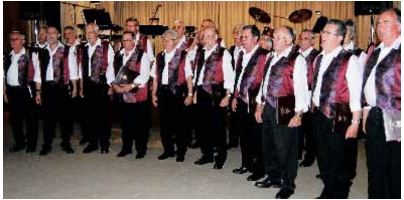
Hochdahler Male Choir from Germany