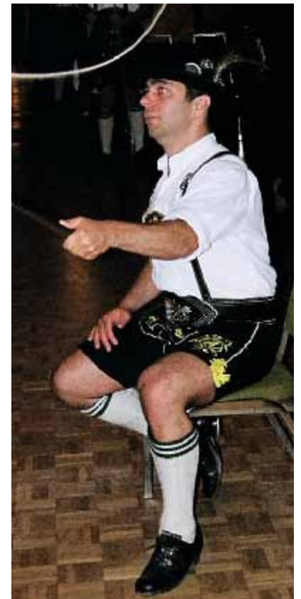
Snapping The Whip To Music!