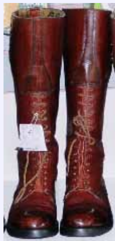
RCMP MUSICAL RIDE BOOTS