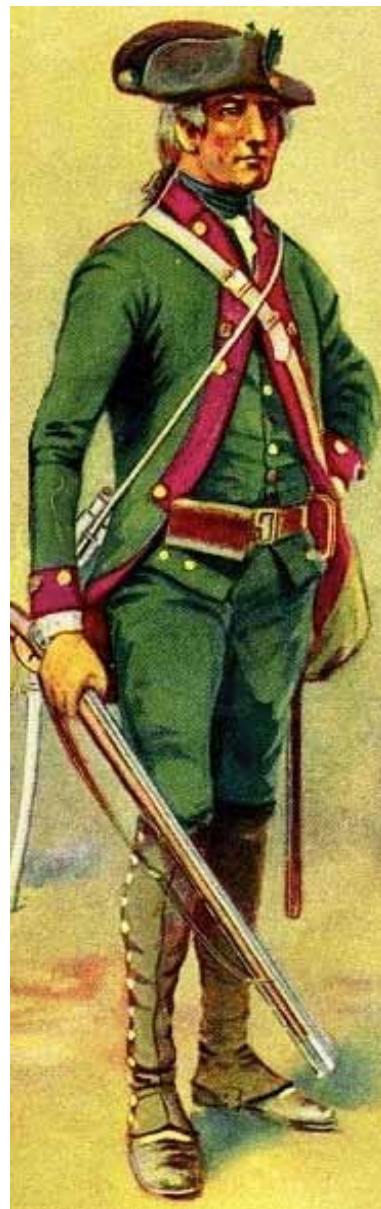
Field Jäger Corps of Hesse-Kassel, 1776-1783

The British employed large numbers of German soldiers ("Hessians") during the American Revolution. The use of foreign troops provided the British with a ready source of well-trained and equipped troops. This relieved the British of the burden of raising an army in England. Foremost in demand were the German Jäger (Jaegers, Yaegers, Chasseurs="Hunters"). They were the European counterpart of the American riflemen. Jägers were well-trained and disciplined soldiers, excellent marksmen, woodsmen, reliable and very capable of independent action.