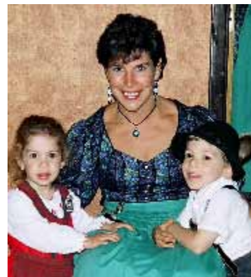
Family Fun Time!