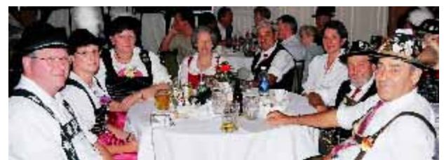
Photo above: On the the right; The Boys and Girls from the Austrian Alps from Inverary, (Kingston) Ontario Canada. On the left; the Schuhplattlerverein Heidengold from Rochester N.Y.