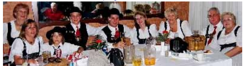
G.T.E.V. Alpenrösl from St. Catharines, Ontario