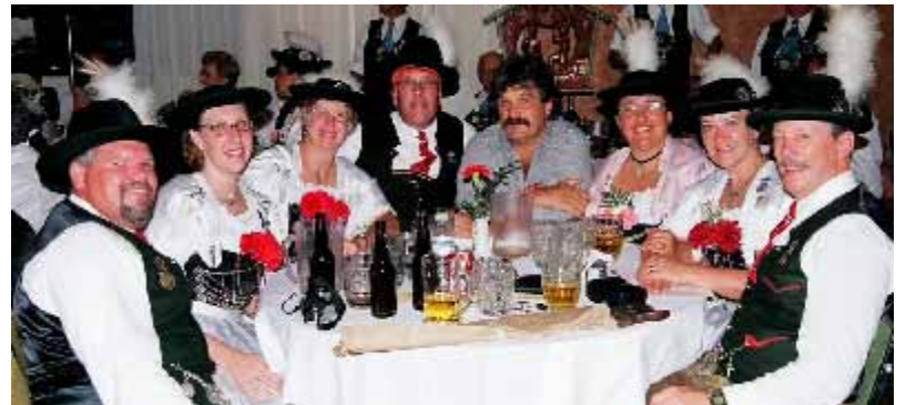
The Bavarian Verein Alpengruen from Rochester New York