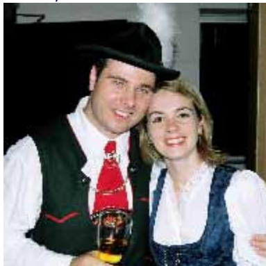
A St. Catherines Hug!

Wine Sales Representative, Private and Licensee Sales