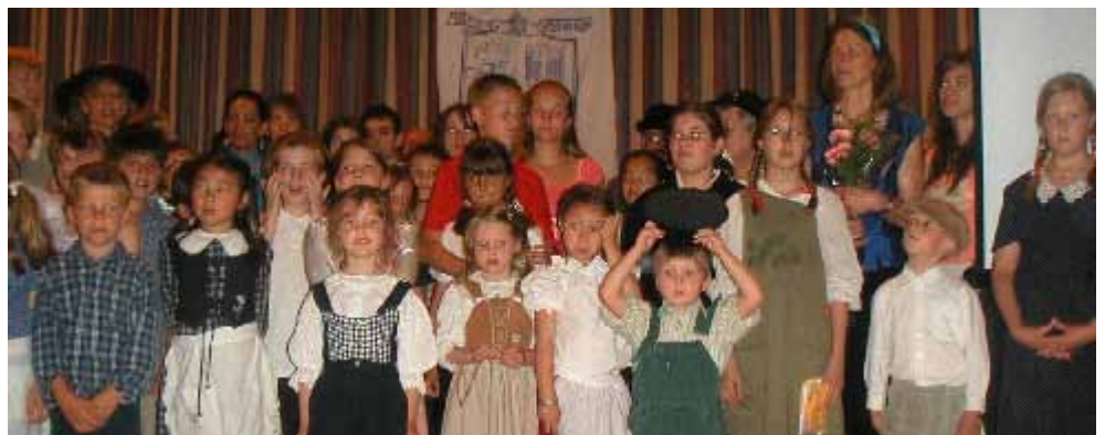
Students of the Hamilton Germania Language School after their historical retrospective through the past 140 years.