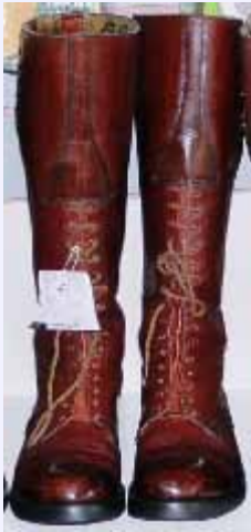
RCMP MUSICAL RIDE BOOTS