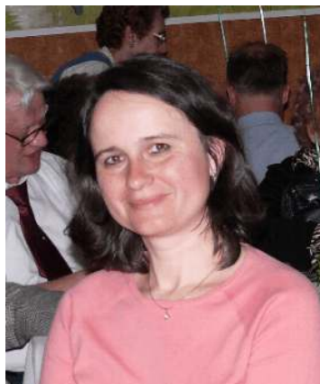
A Russian Miss enjoyed the evening!