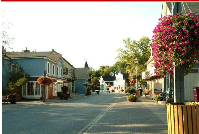
39 th Historical Folk and Cultural Celebration in Unionville, Ontario (Toronto suburb) from the 1 st to the 3 rd of June 2007. Details →

www.thirdworldbazaar.ca/generalstore.html 1004 Manotick Station Rd. 613-822-1659