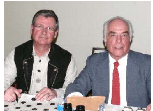
Schützenfest score keepers are kept busy!