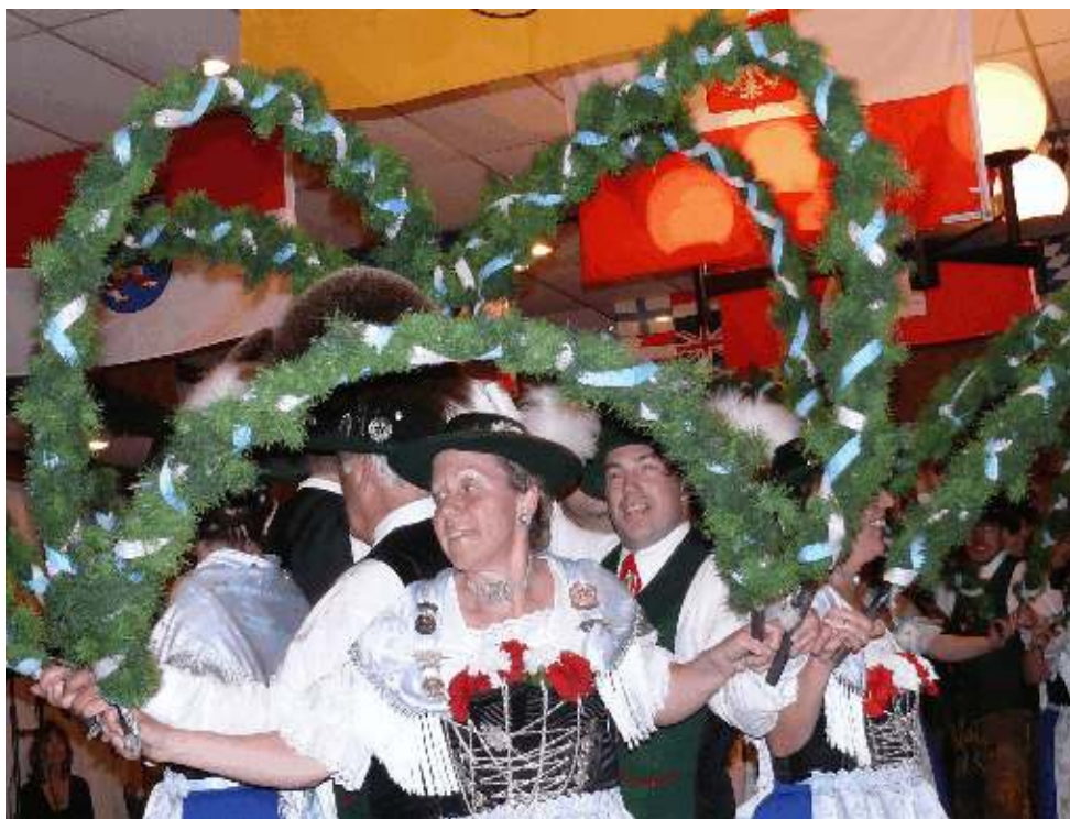
The Maple Leaf-Almrausch Bavarian Folkdancers performing at their Bavarian Evening fundraiser on Saturday, April 28 th . They also performed at the Ottawa Maifest on Saturday, May 26 th .