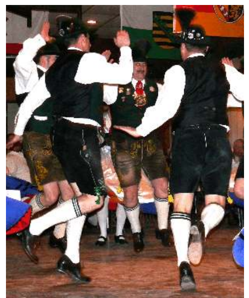
G.T.E.V. Maple Leaf -Almrausch Schuhplattlergruppe of Ottawa