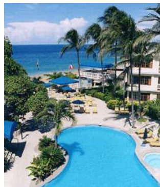
Sosua By The Sea Hotel in the Dominican Republic