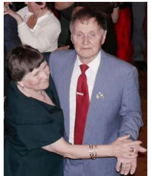
We Love to Dance!