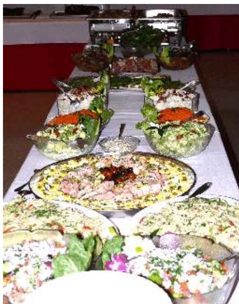
A fantastic meal!