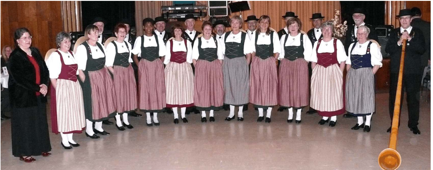
The Montagna Singers of Ottawa, Canada, hosted once again a very successful evening that included a fantastic meal, a great performance by the choir and good dance music by the Duo Oz. Everyone in attendance enjoyed the evening.