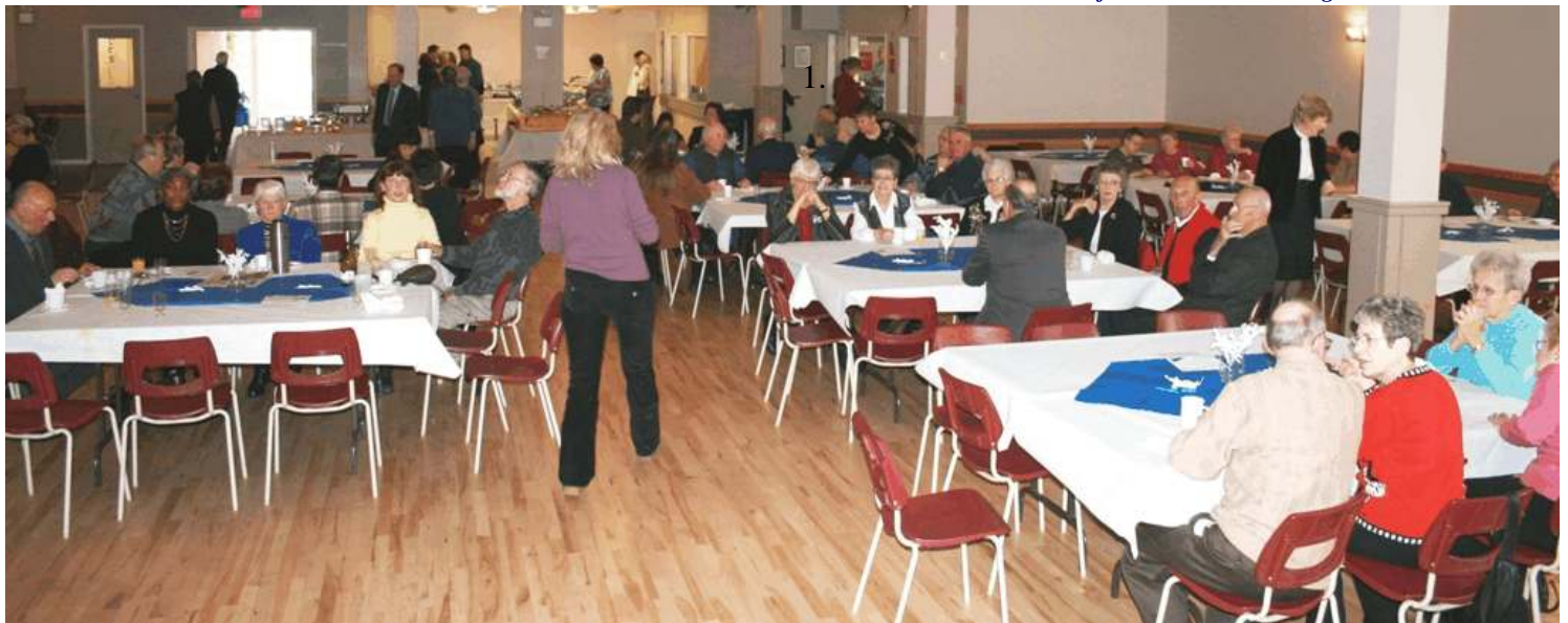
A view of the volunteers feasting on the delicious food provide by Schmidt's Catering