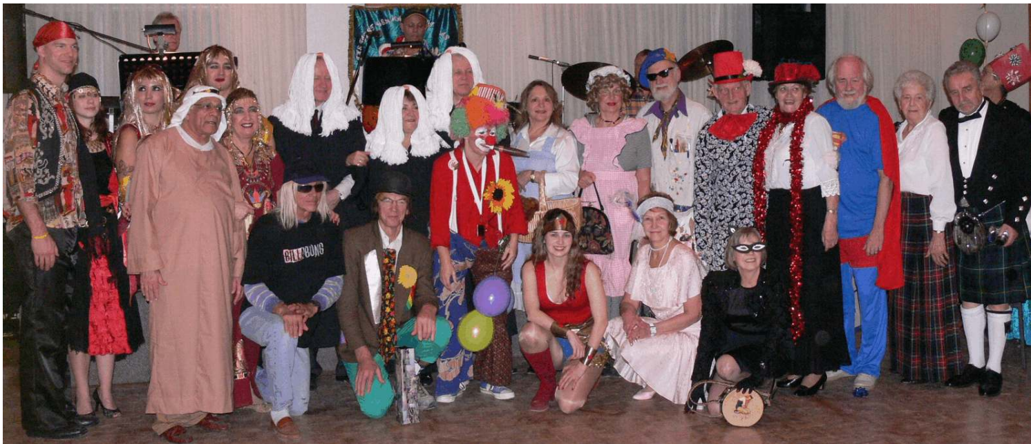
Some of the Costumes at the 42 nd Mardi Gras Costume Ball at the Maple Leaf-Almrausch Club, Sat., Feb. 2 nd , 2008.