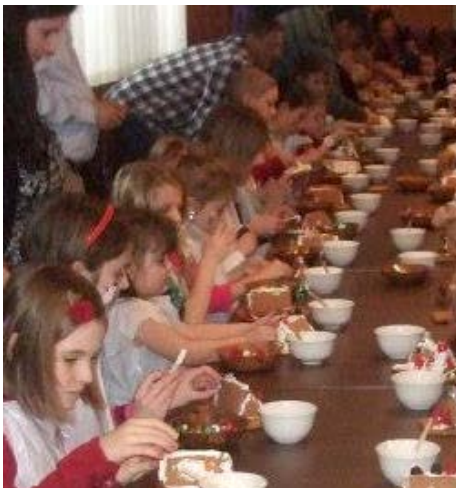
Ginger Bread house building and eating!