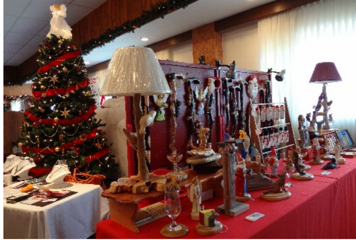
A typical vendor table at the Christmas market.

Hurra!!!!!! My first Christmas Market was successful. The critical details such as weather, volunteer staffing, vendors having enough product, food preparation and delivery, ATM machine working and not running out of money, etc., etc. all worked out. The end result was a turnout as good as last year, customers who were happy, vendors who had good sales and a really beautiful market.