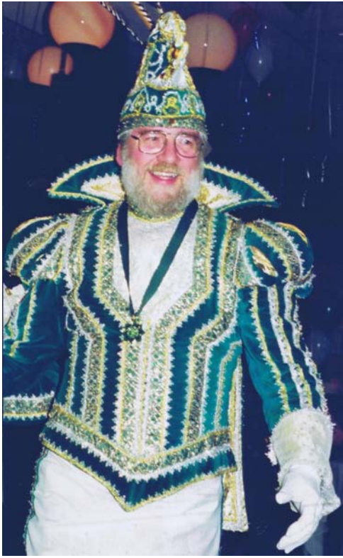
Prince Murray of Sherwood 1995-97

Photo-Story by James MacLaren - Special to The HBH News