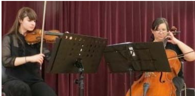
Two performing ladies from "The Canto Sentimento"