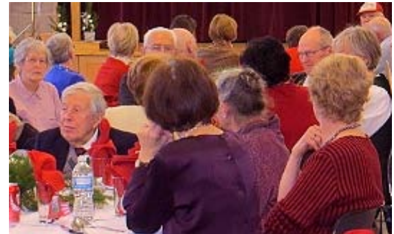
Overview of the guests in attendance